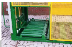
roller conveyor to flatten bags