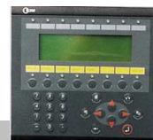
Easy programmable display