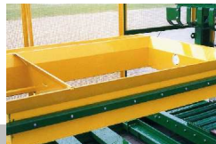
pallet size easy to adjust