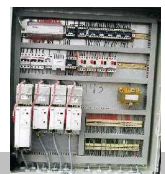
All position motors frequency regulated