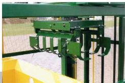
pneumatic bag positioner