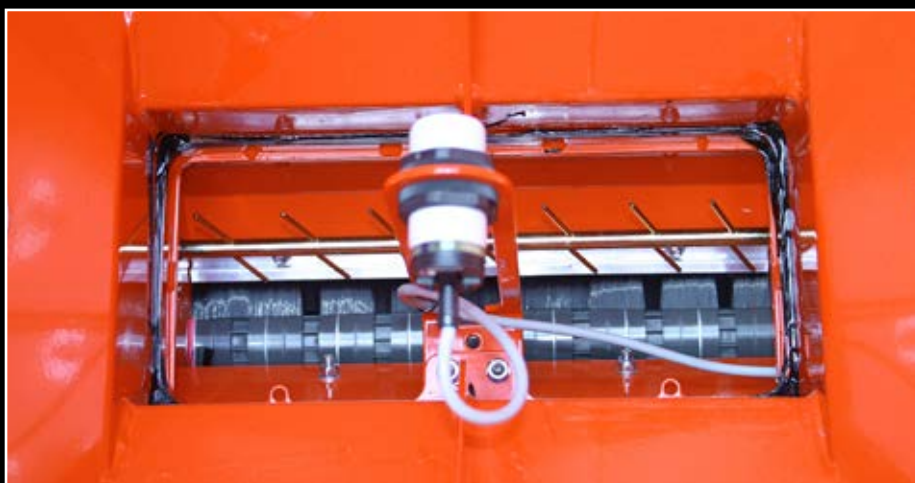
Standard Fill-level sensor on SH500 with control box 5.2.