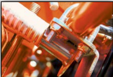
The position of the distribution outlet is before the roller. Position and angle are adjustable.