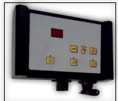
Control box 3.2