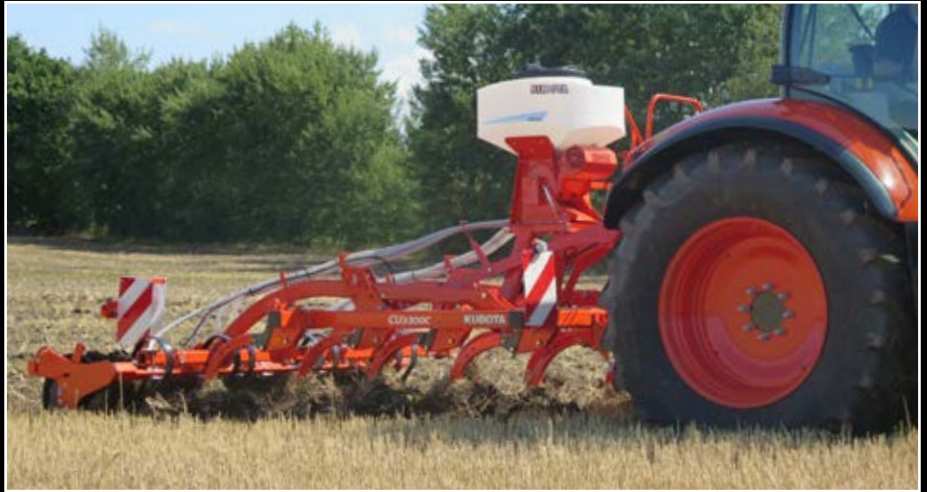
SH200 mounted on a cultivator CU3300