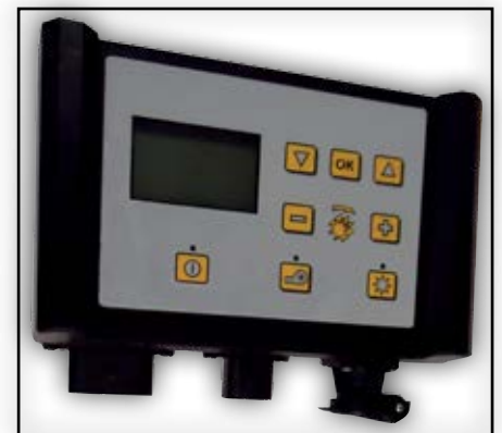
Control box 5.2