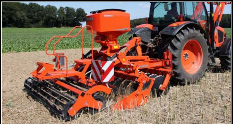
SH500 mounted on a short disc harrow CD2300